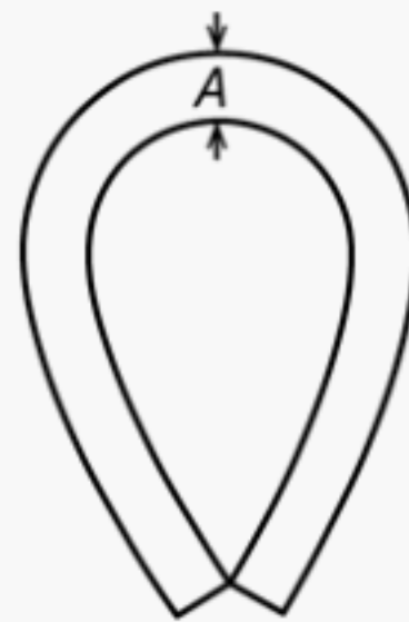
FIG. 3 Bend Test of Vacuum Brake Hose

ASTM International takes no position respecting the validity of any patent rights asserted in connection with any item mentioned in this standard. Users of this standard are expressly advised that determination of the validity of any such patent rights, and the risk of infringement of such rights, are entirely their own responsibility.