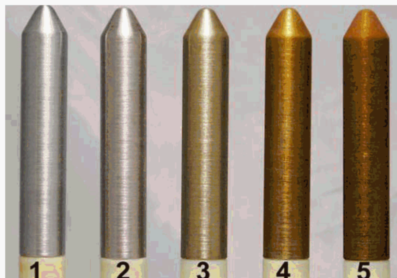
FIG. 3 Example of Visual Rating Scale. Photograph of Steel Test Rods at Each Corrosion Rating, Standards 1 to 5

A The appearance of these iron corrosion products from exposure to water in high ethanol fuels is very different from that observed in petroleum products using Test Method D665 and NACE TM-072 test methods. A numerical rating scale is used in this test method to signify this difference.